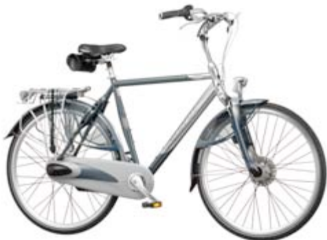
Adagio- NuVinci by Batavus (Netherlands)

However, because the rider can always be in the "appropriate" gear with no gaps and no power losses during shifting, mechanical efficiency should not be the primary measure for the NuVinci CVP. In getting a non-expert rider from point A to point B, the NuVinci CVP compares well with internally geared hubs and derailleurs on the market today, while delivering a superior ride experience.