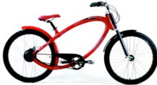
The Ride™ by Ellsworth Handcrafted Bicycles

A: The NuVinci CVP provides a totally new kind of riding experience. Instead of fumbling around to find the right gear, the rider is able to shift immediately and intuitively to meet even the slightest changes in terrain or incline. A twist of the wrist is all that's needed to find the perfect "sweet-spot" for every rider. The NuVinci CVP shifts without noise or hesitation, and eliminates dropped chains caused by mis-shifting derailleurs.